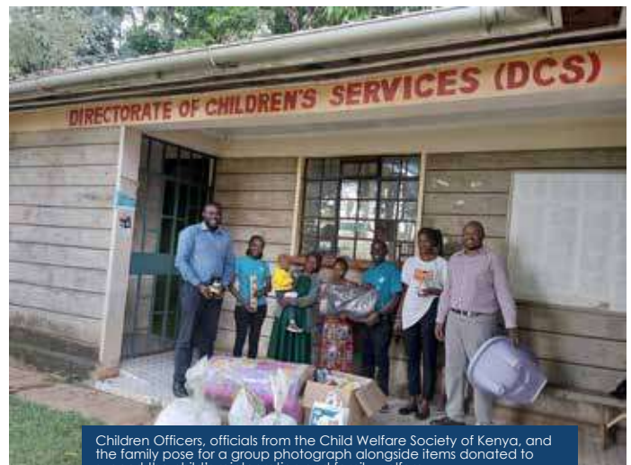
Children Officers, officials from the Child Welfare Society of Kenya, and the family pose for a group photograph alongside items donated to support the child's reintegration and family welfare