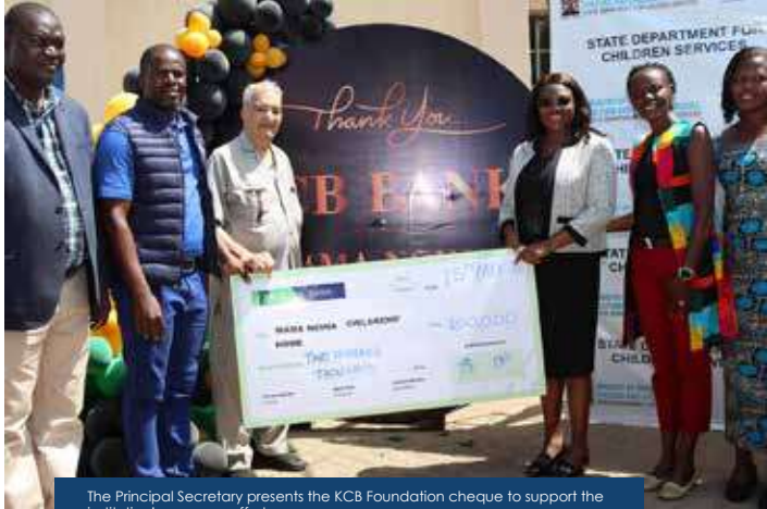
The Principal Secretary presents the KCB Foundation cheque to support the institution's recovery efforts.