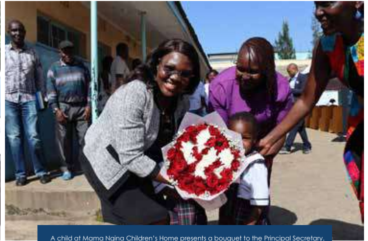
A child at Mama Ngina Children's Home presents a bouquet to the Principal Secretary.