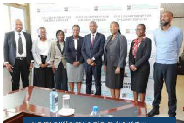
Some members of the newly formed technical committee on child online protection.