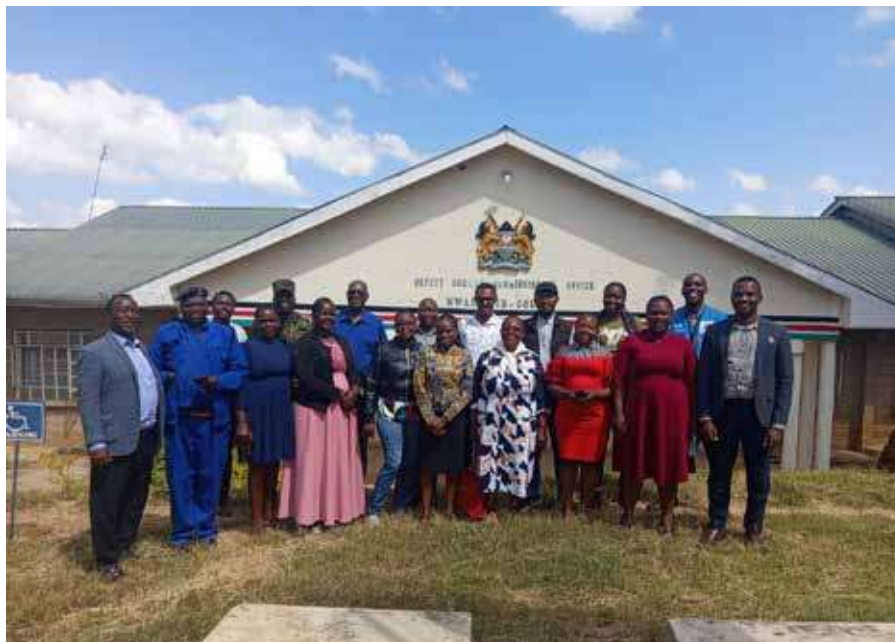
Members of the Mwala Sub-County Children Advisory Committee pose for a group photo after the meeting.

The meeting concluded with a resolution that child protection issues continue to be incorporated as a standing agenda item during village barazas convened regularly by the National Government Administration Officers, in a bid to strengthen community awareness and reinforce child protection efforts at the grassroots level.