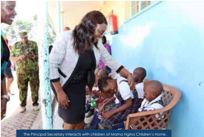
The Principal Secretary interacts with children at Mama Ngina Children's Home.