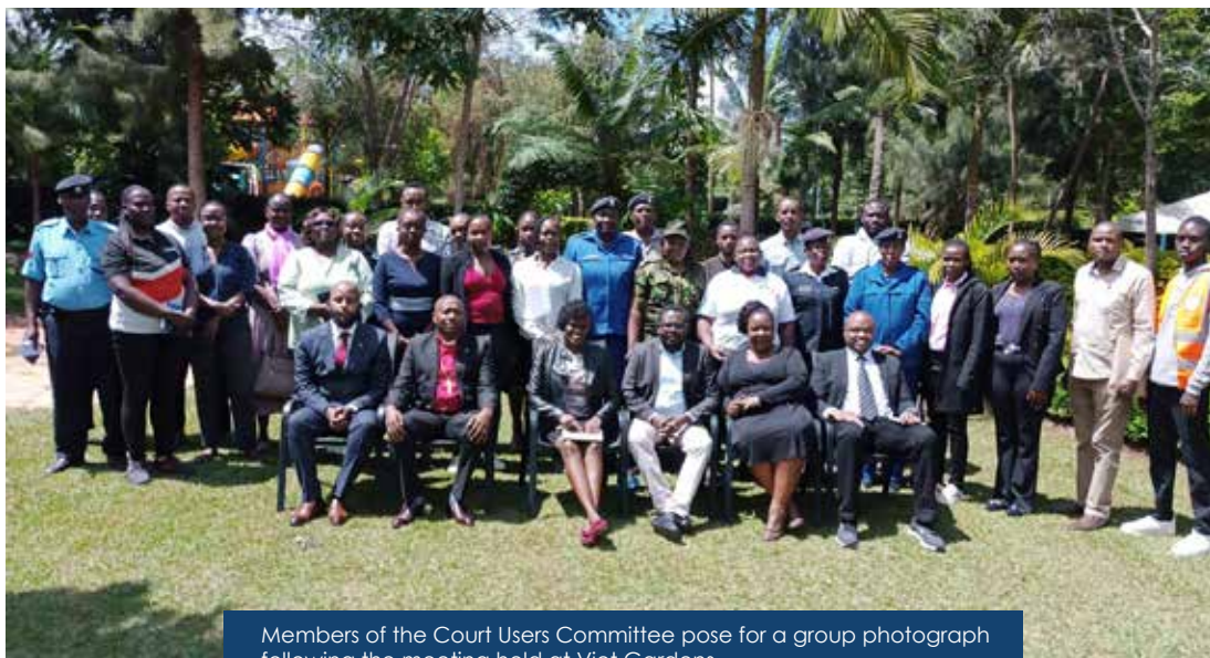
Members of the Court Users Committee pose for a group photograph following the meeting held at Viet Gardens.

The engagement served as a powerful reminder that when institutions unite around data, collaboration, and shared purpose, meaningful protection for children becomes not merely an aspiration, but a practical and lived reality within communities.