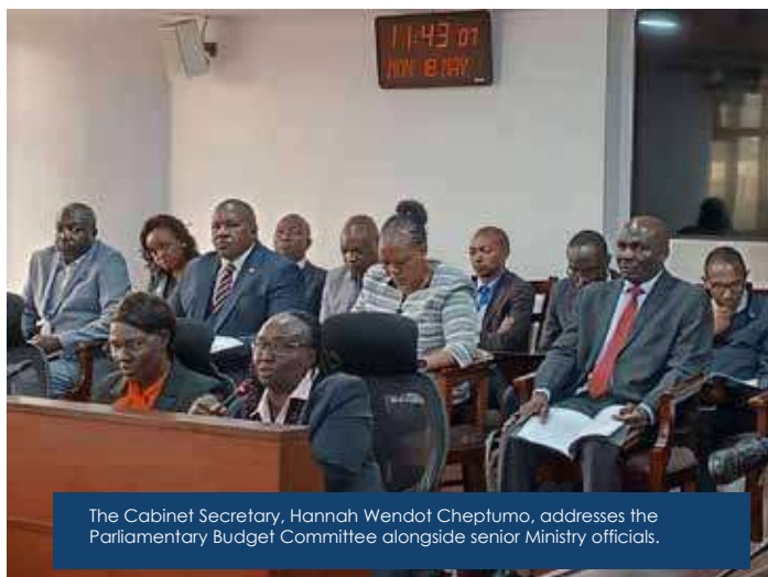
The Cabinet Secretary, Hannah Wendot Cheptumo, addresses the Parliamentary Budget Committee alongside senior Ministry officials.

The engagement underscored the State Department's sustained commitment to strengthening child protection systems, improving institutional capacity, and ensuring effective and responsive service delivery for children and families across Kenya.