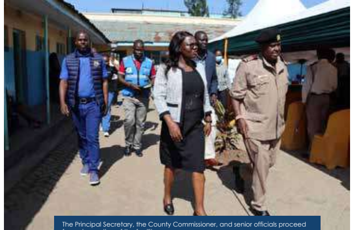
The Principal Secretary, the County Commissioner, and senior officials proceed for an inspection of the facility.