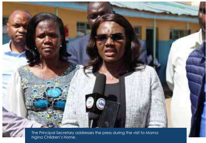
The Principal Secretary addresses the press during the visit to Mama Ngina Children's Home.