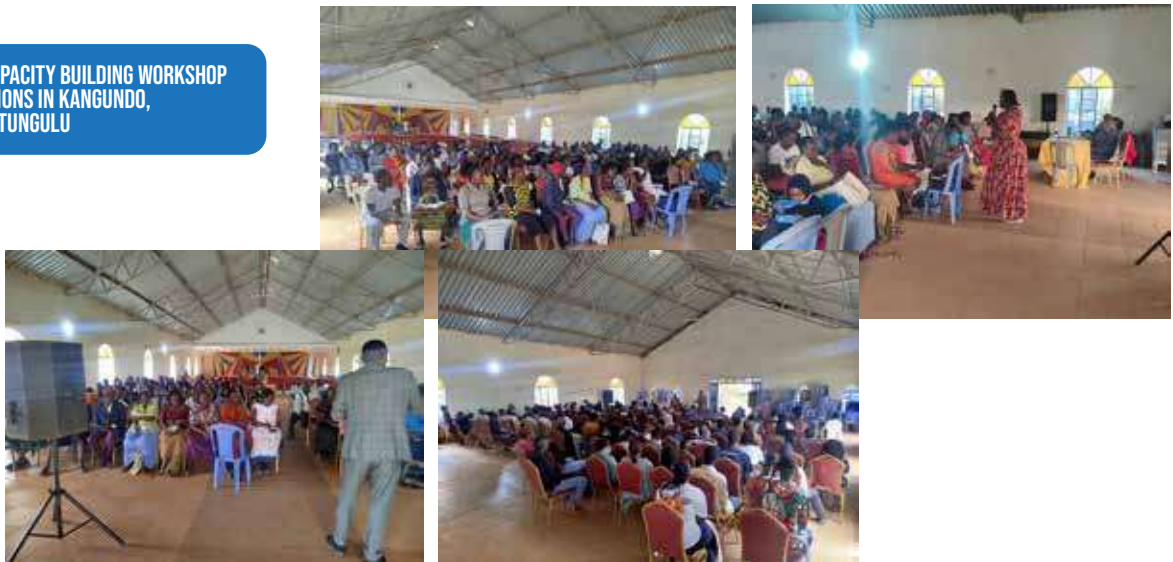
IN PICTURES: CAPACITY BUILDING WORKSHOP GENDER CHAMPIONS IN KANGUNDO, MWALA AND MATUNGULU

The initiative marked a significant step in strengthening community-based protection systems and empowering local champions to drive sustained advocacy for child rights and safer communities across the three sub-counties.