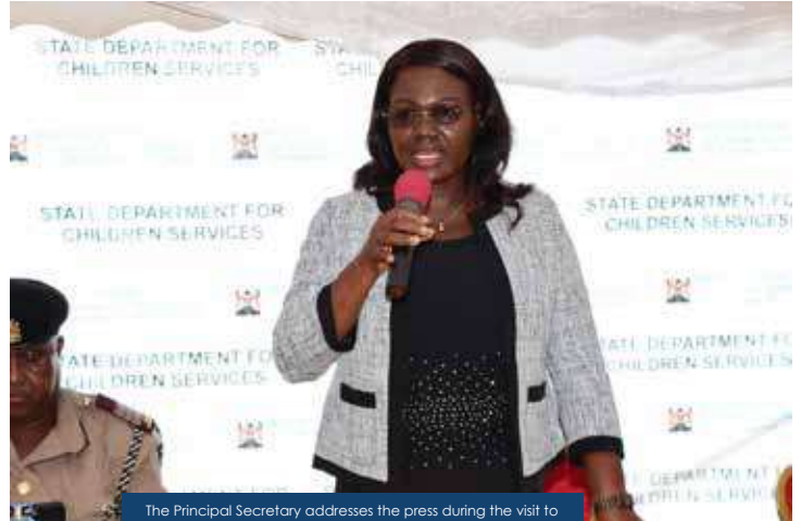
The Principal Secretary addresses the press during the visit to Mama Ngina Children's Home.