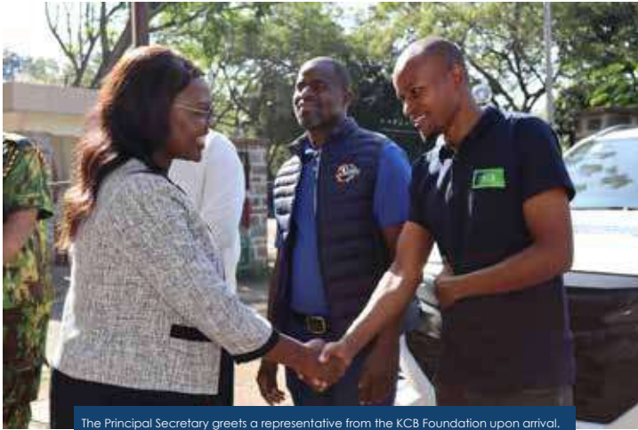
The Principal Secretary greets a representative from the KCB Foundation upon arrival.