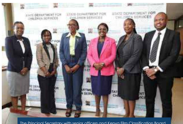
The Principal Secretary with senior officers and Kenya Film Classification Board representatives pose for a group photo